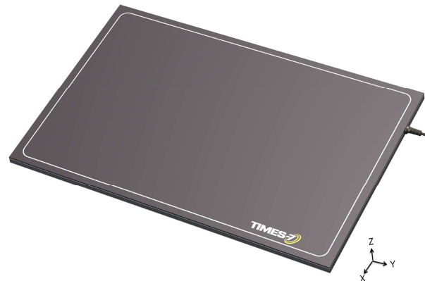
The SlimLine A7040

Ultra-low profile linear polarised flat panel antenna